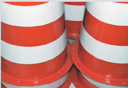
JAG signature FAA orange & white heavy-duty tapered fiberglass radome with smooth finish