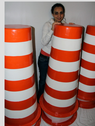
Radome sized for 7-element UHF yagi

JAGY-415-7-RAD-HD Product Specification Sheet.